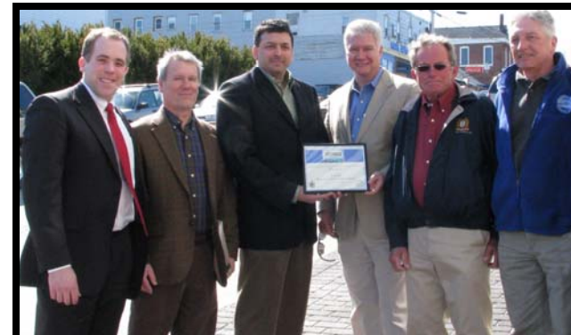
RICHMOND RECEIVES $500,000. CDBG GRANT !