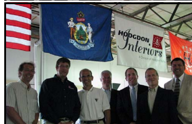
HODGDON INTERIORS, INC. RIBBON CEREMONY!