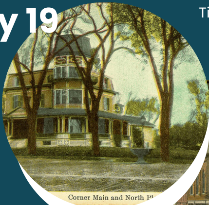
Corner Main and North Streets

Ice Fishing Derby Pleasant Pond Information to come